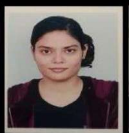
State - Bihar Selected as - PO