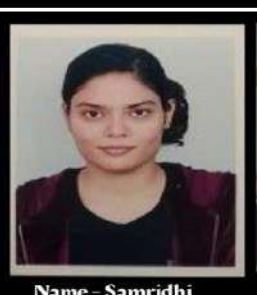
State - Bihar